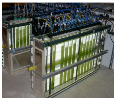
Green Youth Rhenen/Wageningen