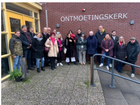
Group photo at the church.

With a look at the meteo, it was decided to make a change in the order of the program. It was said that it would be dry till 3pm. So, we went to the Grebbeberg, a hill between Wageningen and Rhenen. It is known from WW 2. In May 1940 there were heavy fights between the Dutch and German armies. Many soldiers died. The Dutch soldiers who died, are buried on a Military War Cemetery.