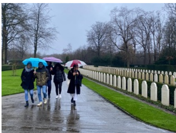
Military Cemetery WW 2.

With a look at the meteo, it was decided to make a change in the order of the program. It was said that it would be dry till 3pm. So, we went to the Grebbeberg, a hill between Wageningen and Rhenen. It is known from WW 2. In May 1940 there were heavy fights between the Dutch and German armies. Many soldiers died. The Dutch soldiers who died, are buried on a Military War Cemetery.