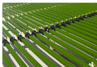
Green Youth Rhenen/Wageningen

Wageningen University and Research: AlgaeParc