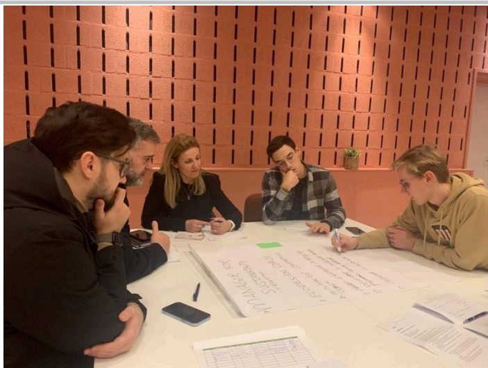
Impressions of the